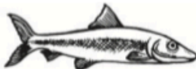
Fish H 30 in.