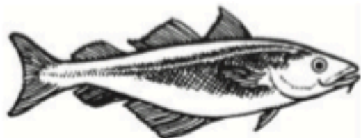
Fish K 42 in.